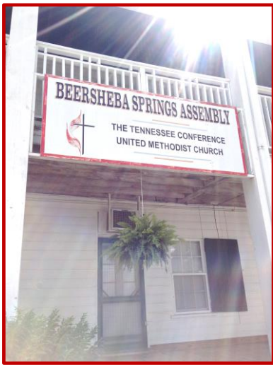
Beersheba Springs Assembly is owned and operated by the TN Conference of the United Methodist Church

“Church camp is kind of like... The most amazing thing ever. We not only have fun going rafting, caving or whatever we are doing for the day, but we have so much fun getting in our small groups- discussing with each other and building those relationships. In our large group time, the worship is amazing. It’s like nothing you’ve ever seen before. I’m a senior, and I’ve been going since I was in 6th grade. So, obviously it must be good if I keep going back, right? You should definitely go! ”